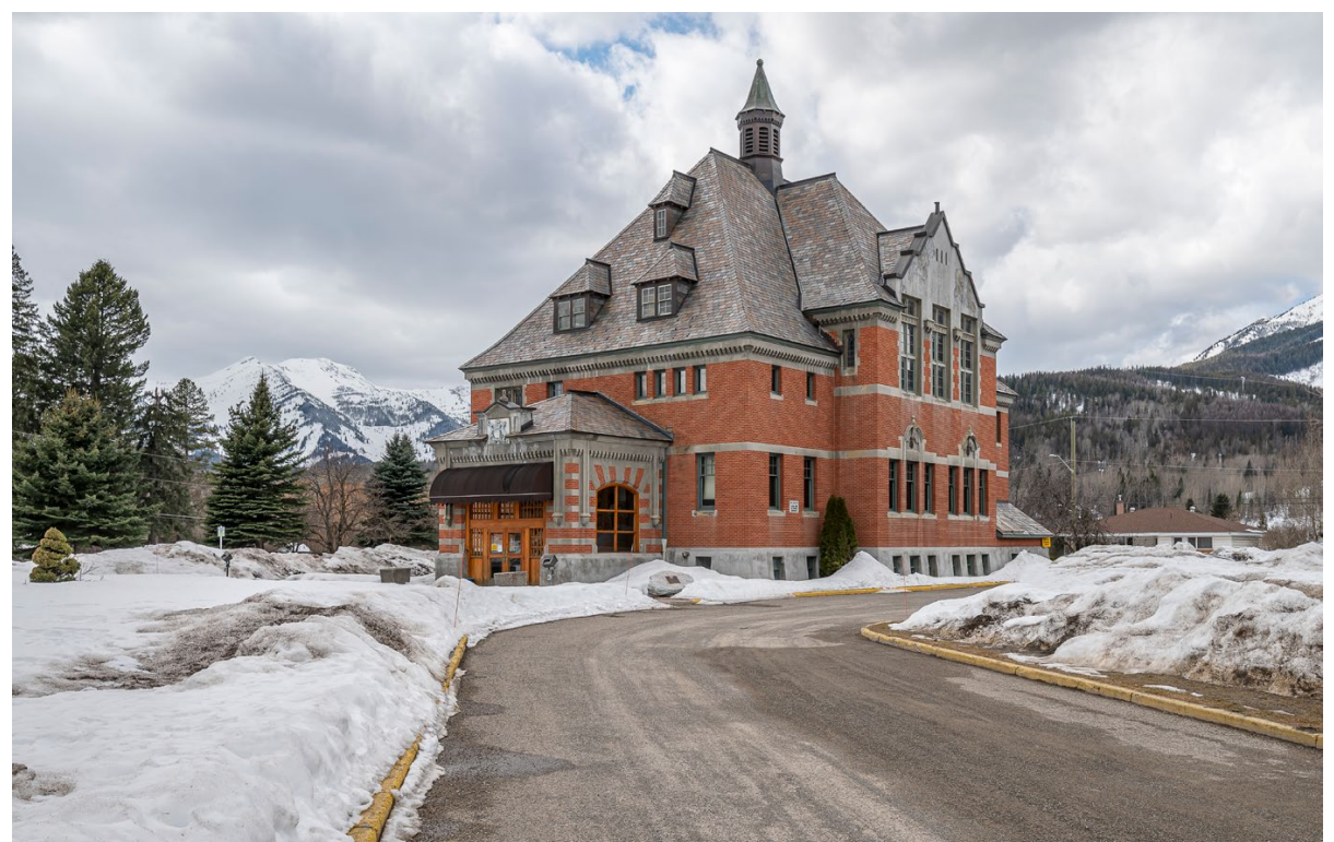
Fernie, BC Courthouse

The higher incidence of violence that women experience in smaller communities, coupled with the detrimental impact that attending court can have on their health, motivated us to explore the experiences of people attending court outside of urban centres in BC.