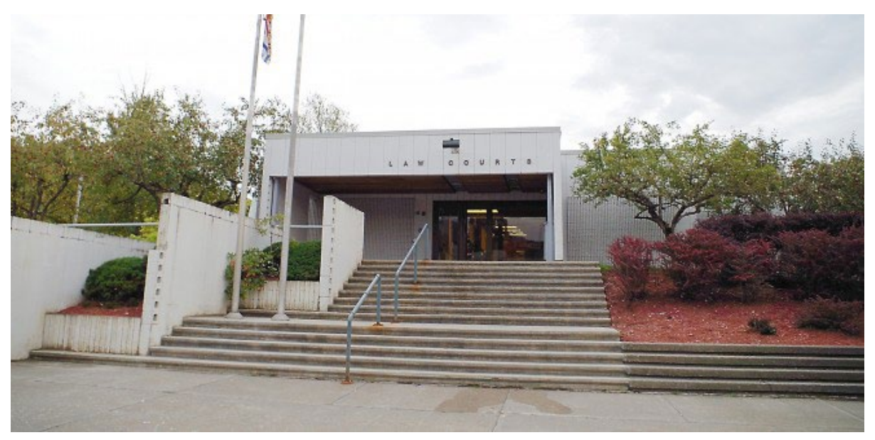
Terrace, BC Courthouse

people who experience PTSD. They often can face challenges, such as impairments to critical thinking capacity, in response to a perceived threat even when none is present.<sup>129</sup> This state of hyperarousal can exacerbate experiences of emotional dysregulation in people who experience PTSD. Research shows that survivors can have difficulty controlling their impulses and regulating emotions, both positive and negative.<sup>130</sup>