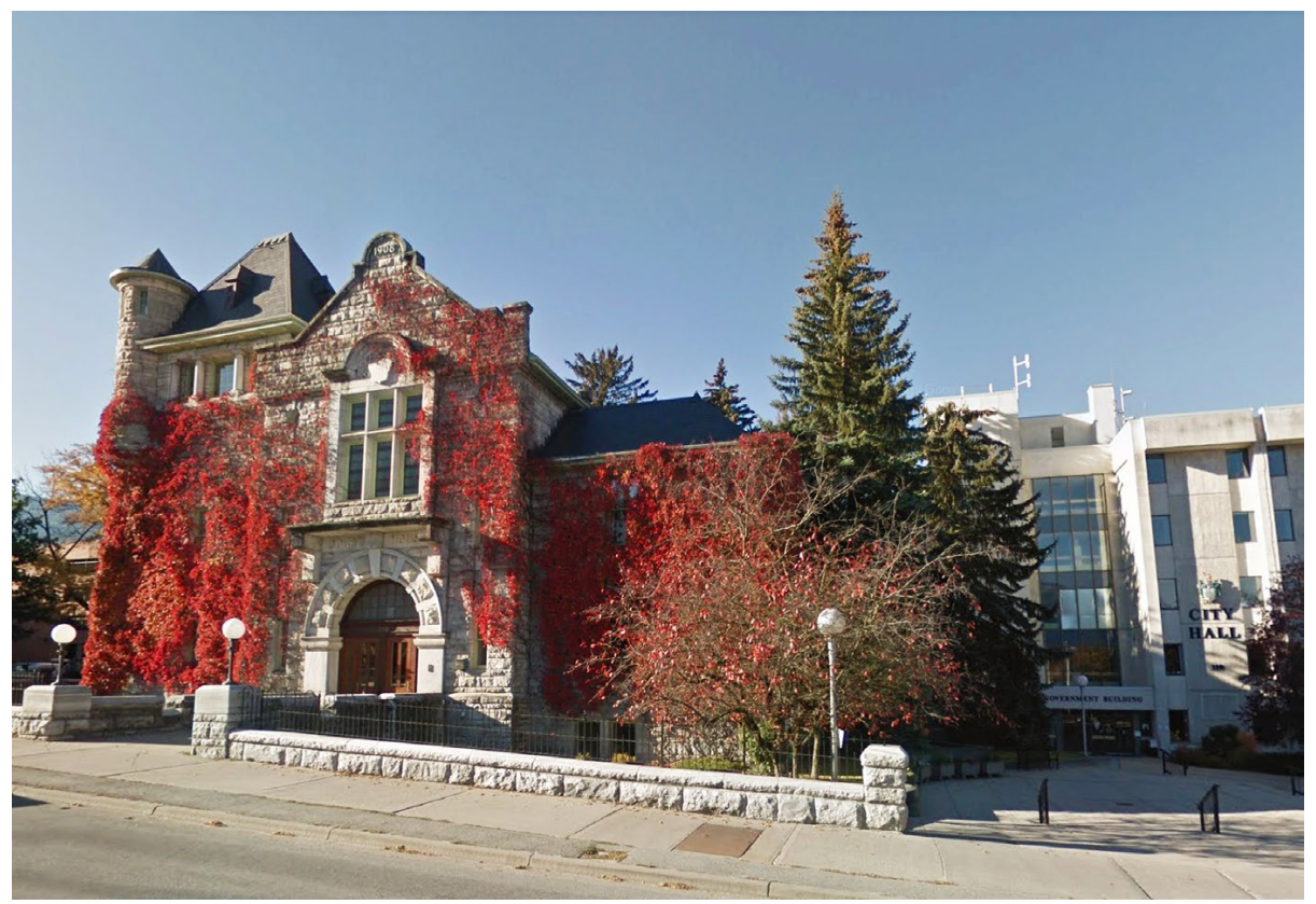
Nelson, BC Courthouse

Our relationships are very special in a small town. We know each other. I know everyone who works in the registry, I know all the Crown counsel and the clerks and sheriffs, so we work together.<sup>173</sup>