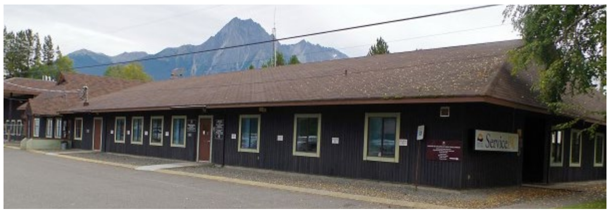
Hazelton, BC Courthouse

Hazelton is definitely pretty close quarters. Everybody who has court that day is sitting in a little room basically.<sup>35</sup>