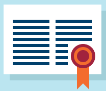
Wills + Estates